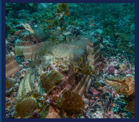
Case 2: Nature-based structures can facilitate project progression in or near protected habitat, where site condition would preclude standard construction materials