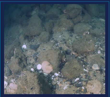
Case 4: Developers can selectively implement nature-based design, in areas that would benefit most from augmentations, as informed by ecologically meaningful monitoring.