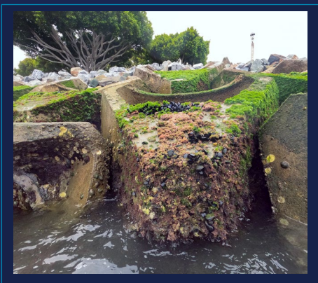
Case 3: Environmentally conscious projects can appeal to the public and facilitate project progression by demonstrating the developer is acting in good faith to benefit the environment.