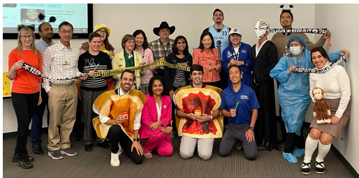
Halloween and Graduation Celebrations