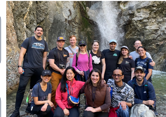
Faculty Hiking Activity