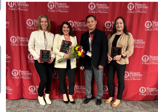
Honors Day Awards: Preceptor of the Year and Staff Members of the Year