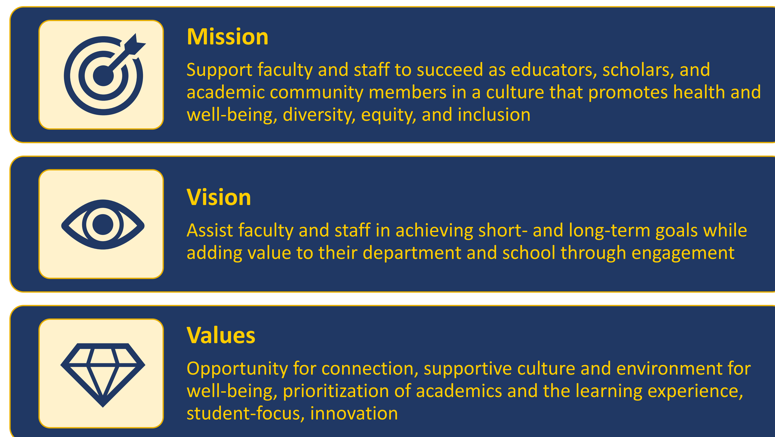
Figure 1. Mission, Vision, and Values