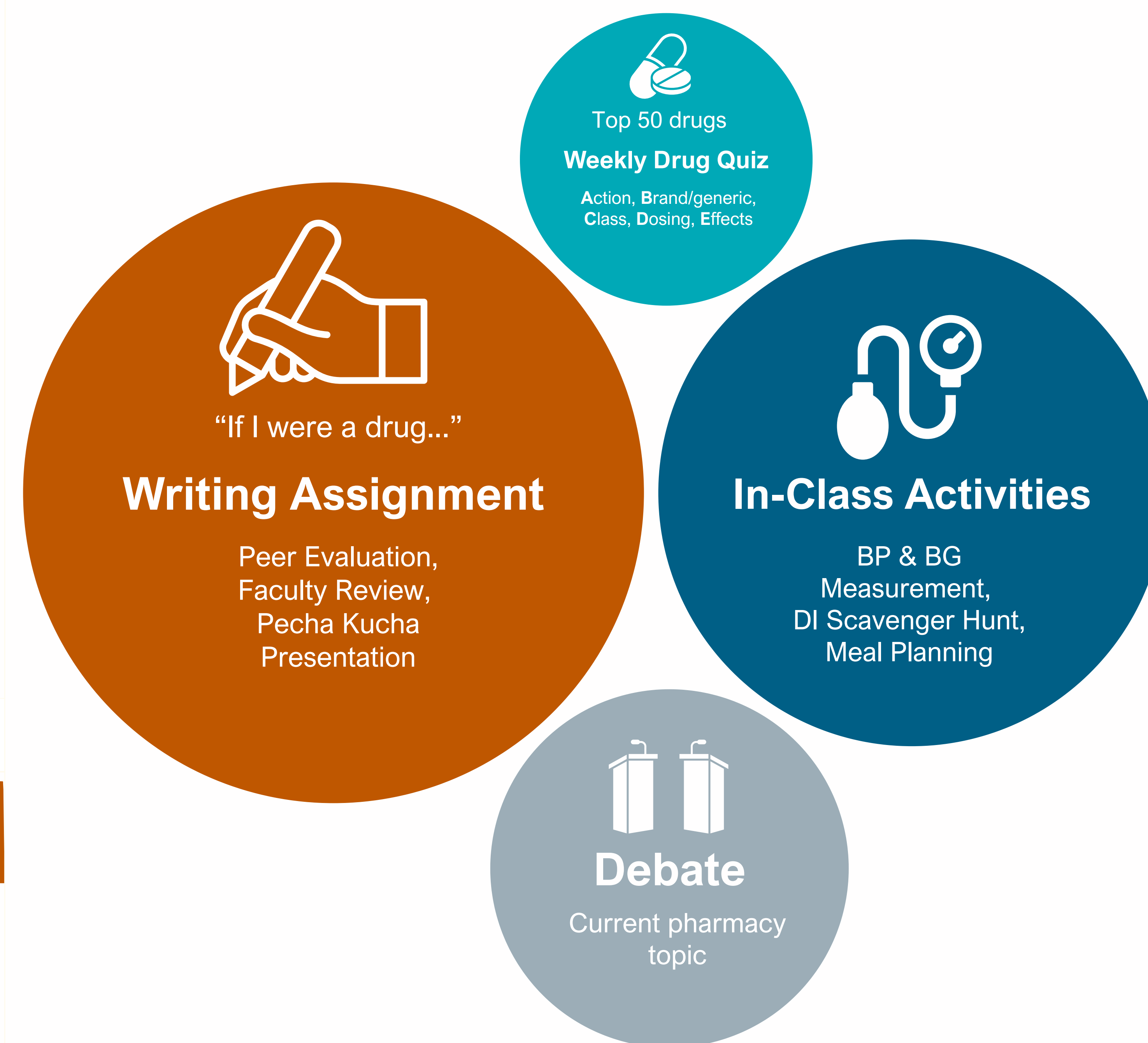
Figure 2. Core Course Elements