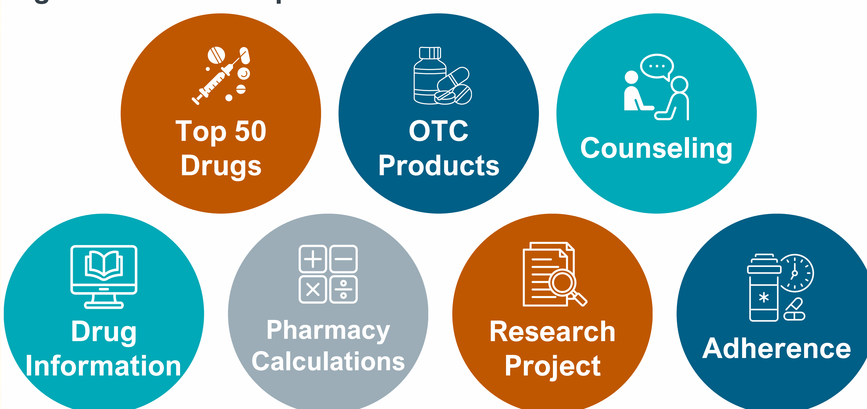
Figure 1. Course Topics