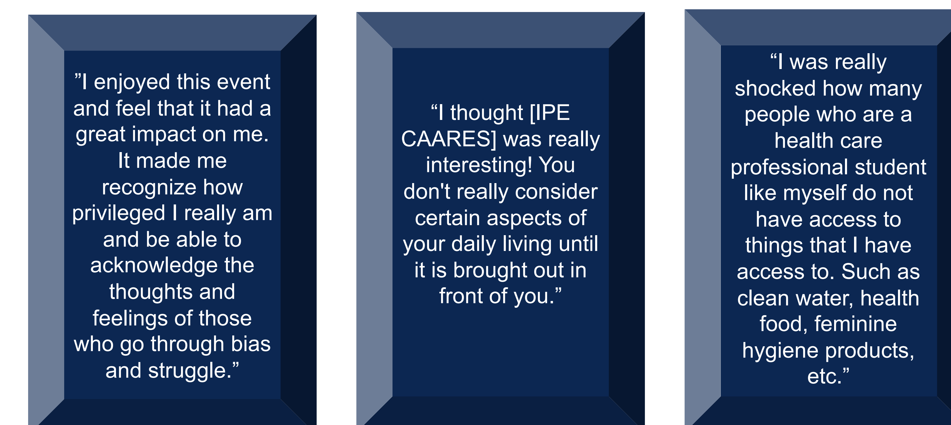
Figure 2. Quotes from IPE CAARES Participants