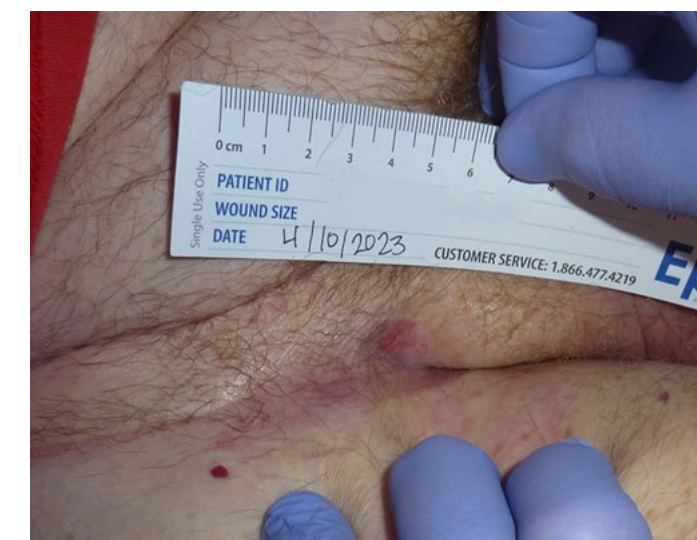
Final Healing Outcome (4/10/2023)