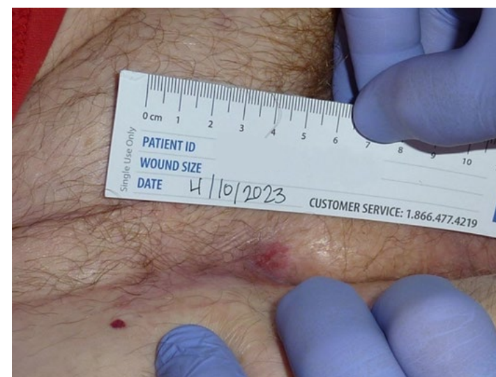
Week 4 Follow up (4/10/2023) Wound size: 2 mm x 4 mm