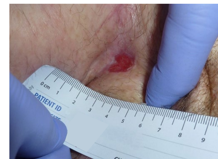
Week 1 Follow up (3/23/2023) Wound size: 1.5 cm x 1.0 cm x 0.2 cm